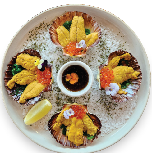
海膽拼盤 (UNI PLATTER)