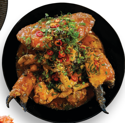
X.O. 皇帝蟹 (X.O. KING CRAB)