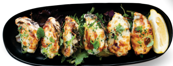
焗烤生蚝 (OYSTERS MORNAV)