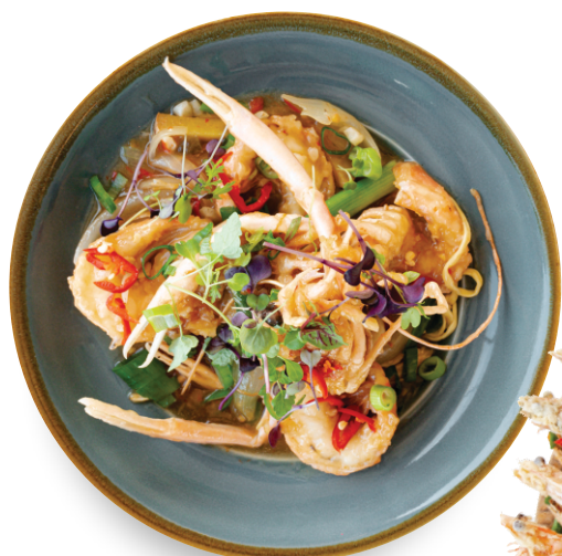
X.O. 酱炒螯虾 (X.O. SCAMPI)