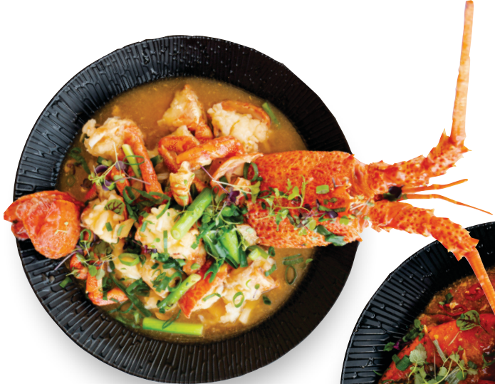
姜葱龙虾 (GINGER & SHALLOTS LOBSTER)