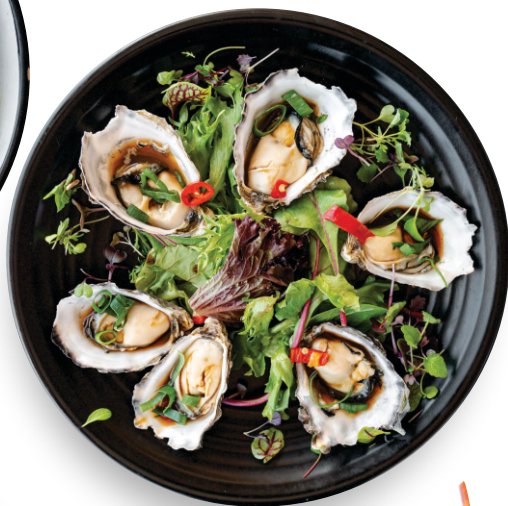
蒸生蚝 (STEAMED OYSTERS)