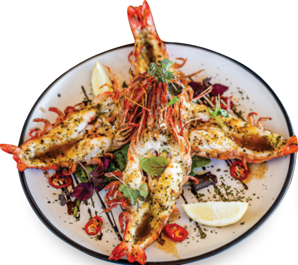
辣椒蒜蓉大蝦 (CHILLI GARLIC PRAWNS)