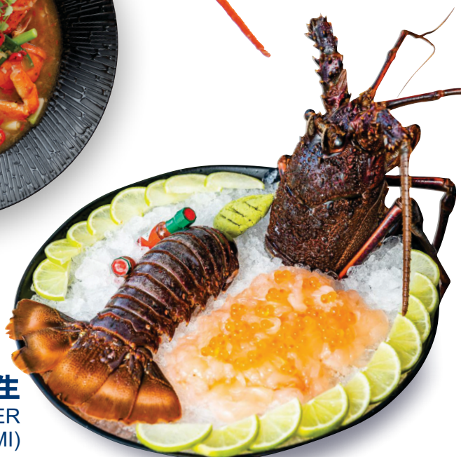
龙虾刺生 (LOBSTER SASHIMI)