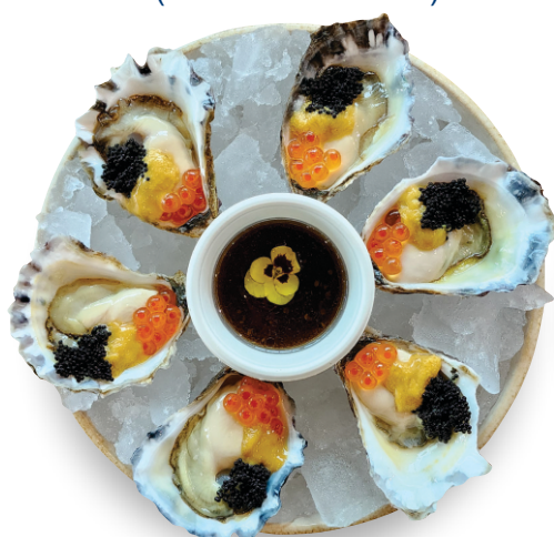
生蠔魚子醬 (OYSTERS CAVIAR)