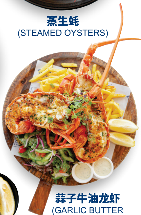
蒜子牛油龙虾 (GARLIC BUTTER LOBSTER)