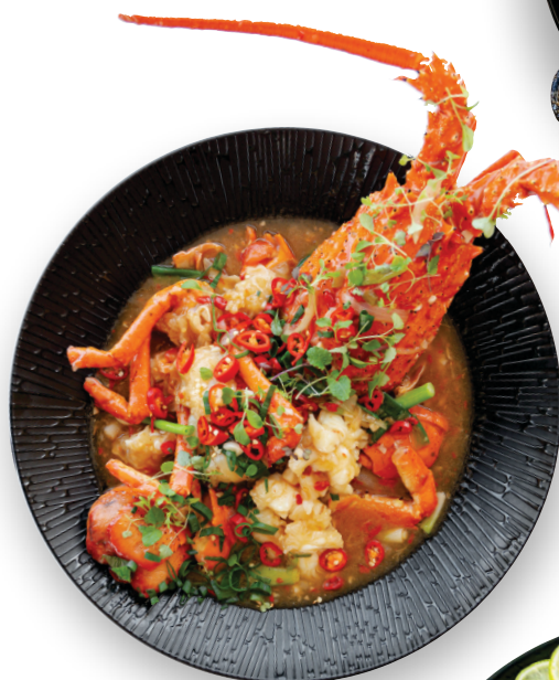
X.O. 龙虾 (X.O. LOBSTER)