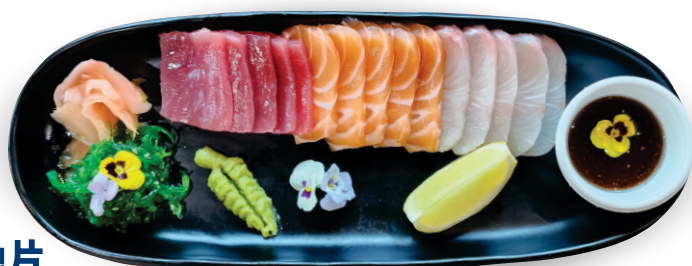
混合生魚片 (MIX SASHIMI)