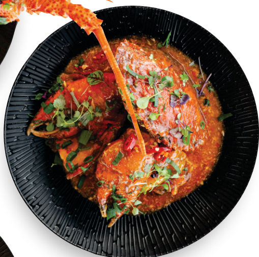
新加坡辣椒泥蟹 (SINGAPORE CHILLI MUD CRAB)