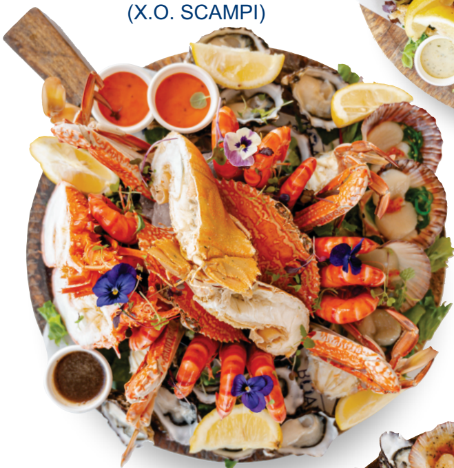
冷海鲜拼盘 (FRUITS DE MER PLATTER)