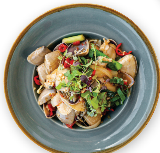
XO酱炒游水蚬 (XO PIPIS)