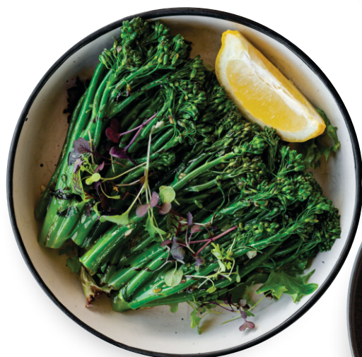
烤时蔬 (STEAMED BROCCOLINI)