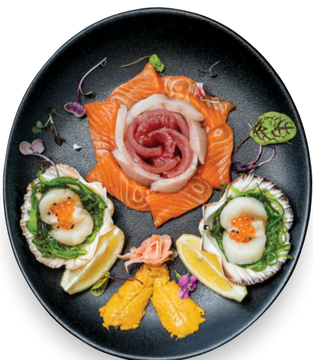
刺身拼盤 (SASHIMI PLATTER)