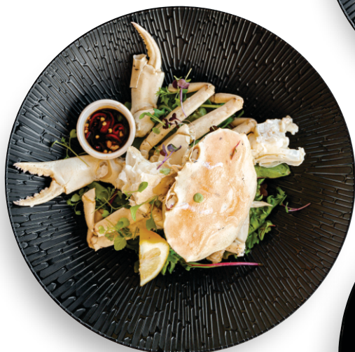
蒸雪蟹 (STEAMED SNOW CRAB)