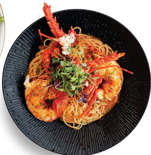
活龙虾意大利面、现点现煮 (LIVE LOBSTER SPAGHETTI)