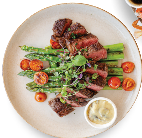
和牛牛排 (WAGYU PICANHA)