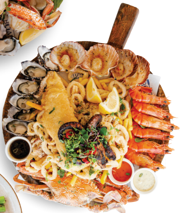
海鲜综合拼盘 (SEAFOOD PLATTER)