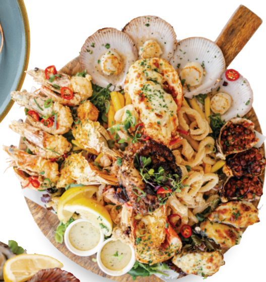
活龙虾拼盘 (LIVE LOBSTER PLATTER)