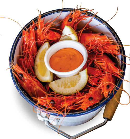
蝦桶 (PRAWN BUCKET)